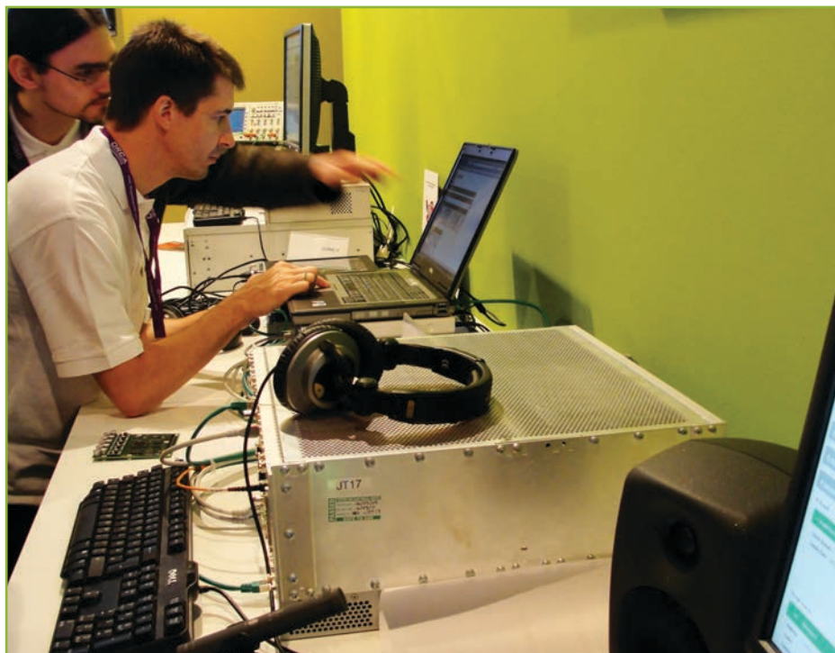
The first working demonstration of the new audio-over IP (AoIP) was tested in the RAVENNA booth during the International Broadcasting Convention (IBC) 2010.

The RAVENNA initiative was introduced at IBC 2010 in Amsterdam with several public demonstrations where companies such as Genelec, DirectOut, and Lawo provided the first working solutions.